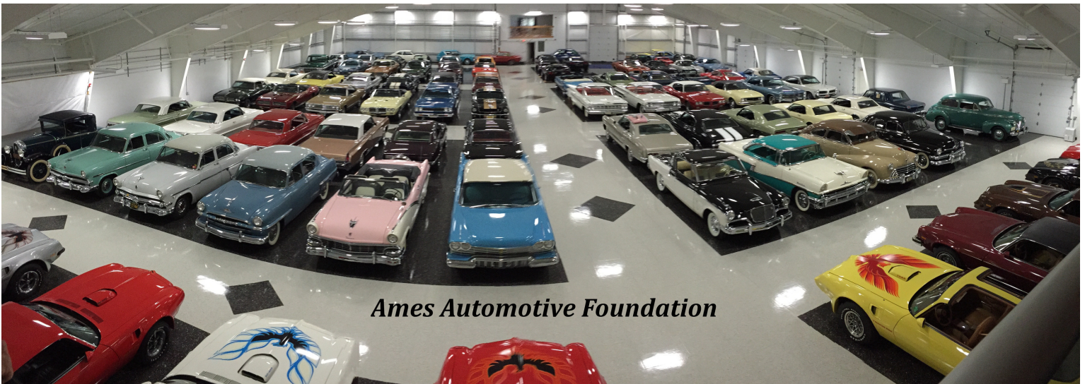
Ames Automotive Foundation

To visit the Ames Automotive Foundation website, CLICK HERE