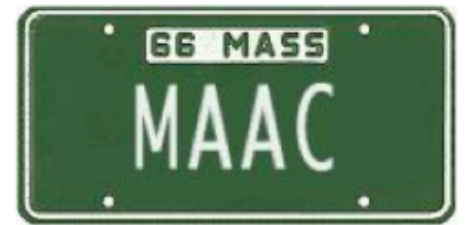
Massachusetts Association of Auto Clubs