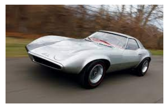
Tin Indian Red Baron Banshee