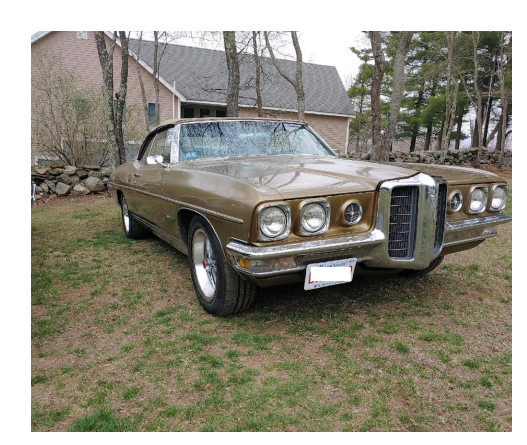
Steve's '65 2+2